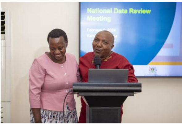
Speakers at the National Data Review Meeting in Uganda, February 9, 2024.