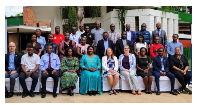
Malawi SEED midline evaluation dissemination meeting with USAID, Ministry of Education, and local actors.

In Moldova, D4I finalized the guidance documents