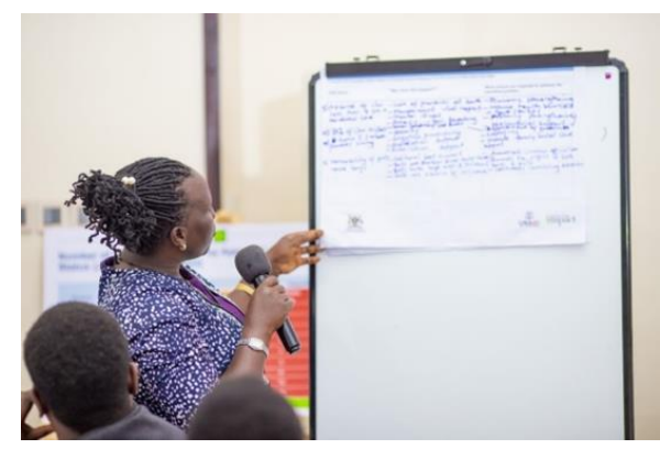
A participant presenting at the National Data Review Meeting in Uganda, February 9, 2024.