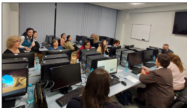
Data analysis training, November 2022, source: DGPDC Chişinău

In response to the troubling findings, the Chişinău DGPDC implemented a comprehensive system for regularly documenting incidents of violence, neglect, exploitation, and trafficking of children. Through collaborative efforts, it has entered into partnership agreements with civil society organizations and donors, aiming to enhance support and assistance for children lacking parental care, as well as those from vulnerable families. Working closely with various stakeholders, the DGPDC organized regular capacity strengthening activities for approximately 500 specialists in child rights protection, along with parental skills development sessions for around 1,700 parents and other caregivers. These efforts were designed to bolster child safety measures and prevent instances of abuse.