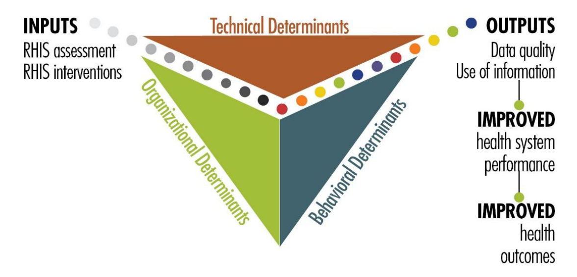
Figure 1. PRISM Framework