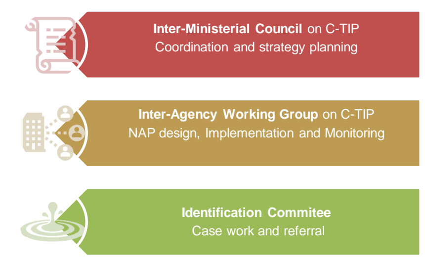
Figure 1: Armenia C-TIP Coordination and Institutional Framework

The C-TIP landscape assessment discovered that there are well-laid structures to govern anti-trafficking of persons in Armenia. These structures include three platforms for correspondence and decision-making at the policy level, enforcement level, individual case level as shown in Figure 2.